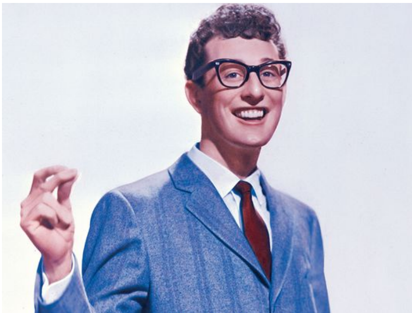
Buddy Holly