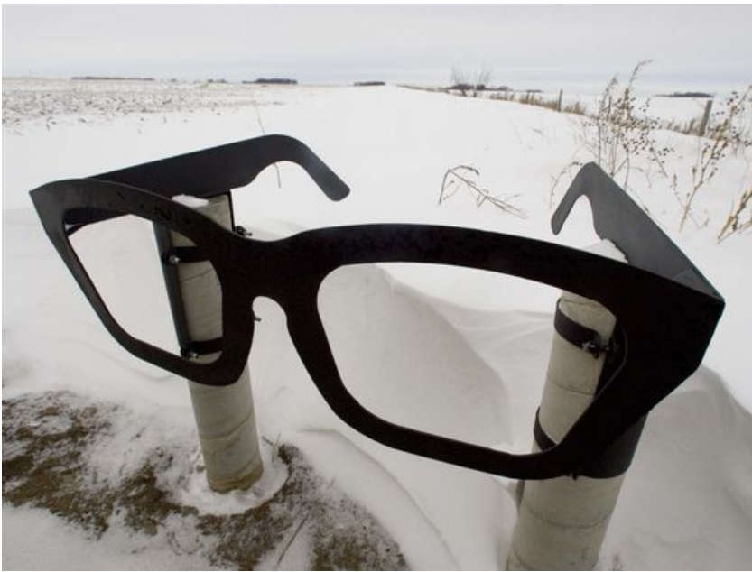
A giant pair of Buddy Holly eyeglasses marks the roadside spot that leads to the crash site north of Clear Lake.

He also was the first to find the plane the next morning when he traced Peterson's flight path. He even saved and stored the wreckage.